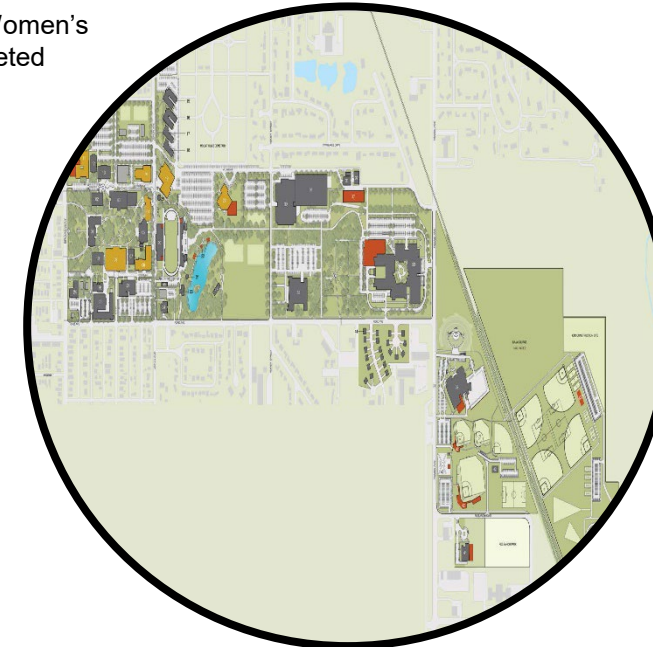
Strategic Plan Guiding New Master Plan and Campus Space Utilization