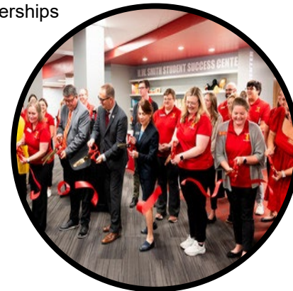
H.W. Smith Student Success Center at Axe Library Opens