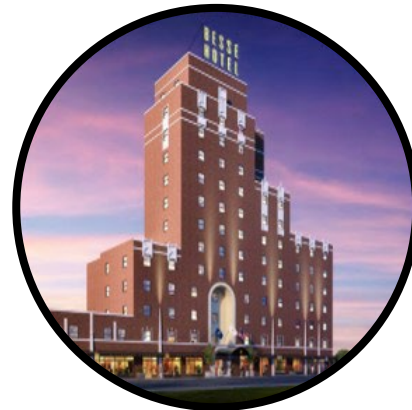
Gorilla Rising's Student Housing Development of Besse Hotel Begins