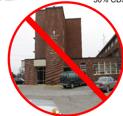
Shirk Complex Abatement for a 2025 Demolition Bidding