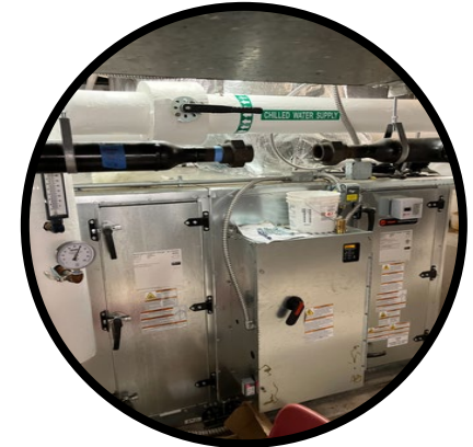
Nearly $5M of HVAC Work Completed