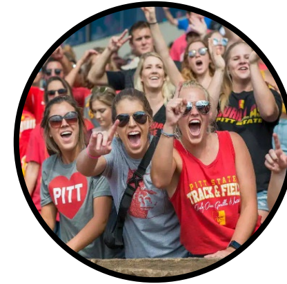
Student Enrollment, Transfers, and Retention Gains Announced