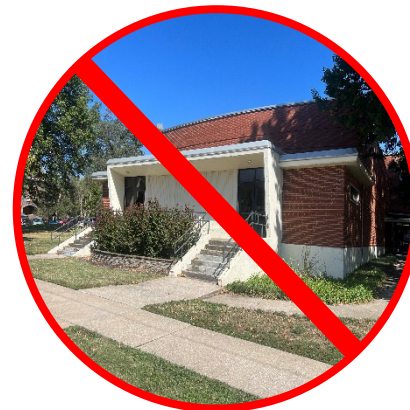
Old College HS Demolition to Follow New Kelce College of Business