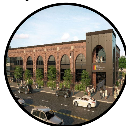
Gorilla Rising's New Kelce College of Business DB Team Selected