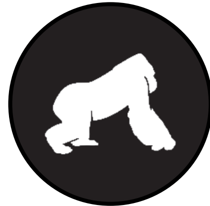
Gorilla Rising Inspiring New and Expanded Partnerships

State, Federal, and Private Funds are Catalysts for Campus Change.