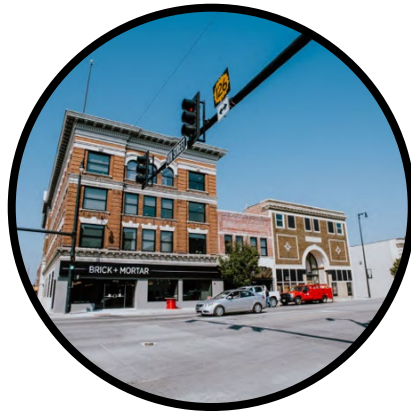
Gorilla Rising's Block 22 Purchase Progressing