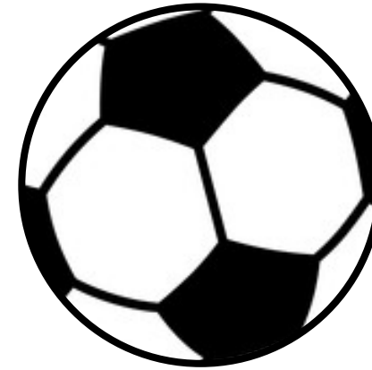
Soccer Pitch for Women's Soccer Completed