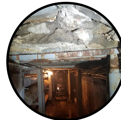
Major Repairs of Campus Utility Tunnels Bidding