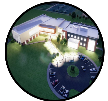
Tyler Prove-Out CMAR 50% CDs Completed