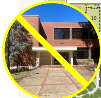
Old Kelce Center to be Demolished 2027