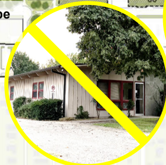
Old Student Health Center to be Demolished 2027