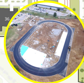
New Outdoor Track Completes 2026