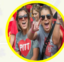
Student Enrollment, Transfers, and Retention Gains Announced again Fall 2025