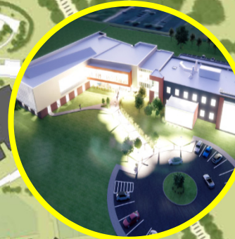
Tyler Prove-Out Expansion Breaks Ground 2025