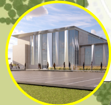
New KBI PRCL Breaks Ground 2025