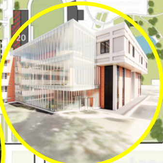
Heckert Yates STEM Expansion Program Approved 2025