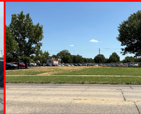
Shirk and Shirk Annex Demolished 2025