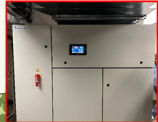
HVAC, Fire Alarm, Elevator, and Roof Upgrades Continue