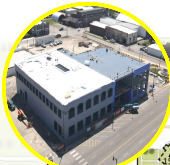
New Kelce College of Business Completes 2026