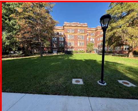
Utility Tunnel Repairs and New Steam Lines Complete 2026