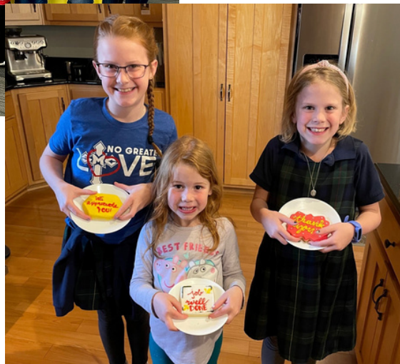
Look at these sweet girls!