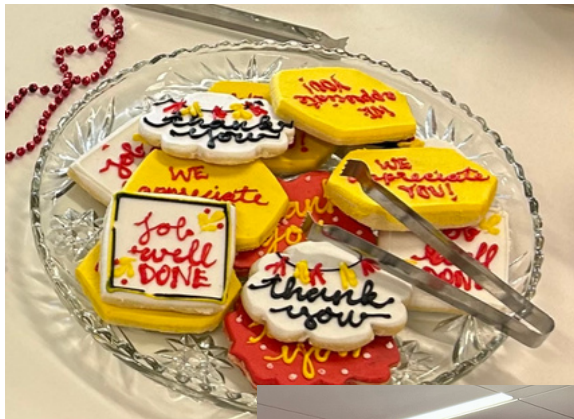
Cake Shed Cookies

We would love to see all your pictures. Please email them to hrsstudent@pittstate.edu .