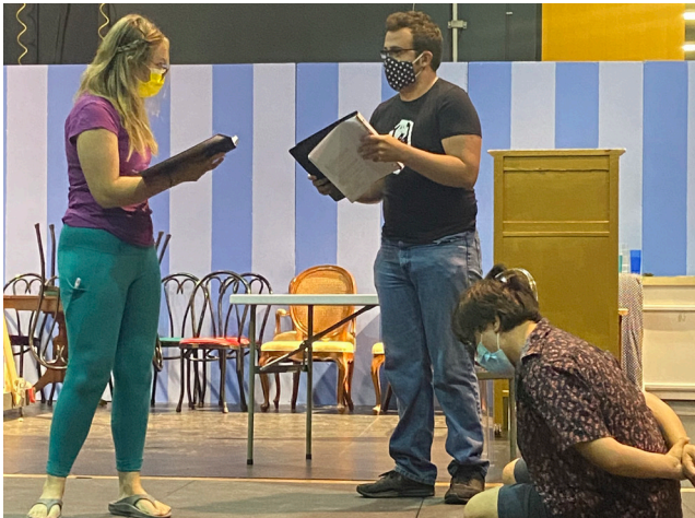
Rehearsing a group scene