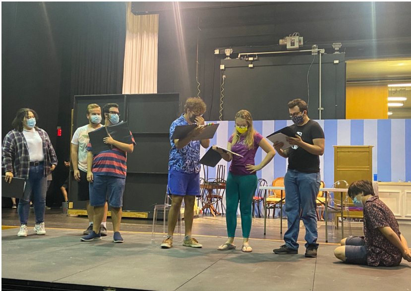
Most of the cast during rehearsals