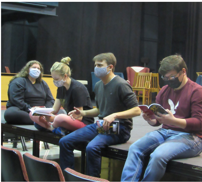
The cast running lines