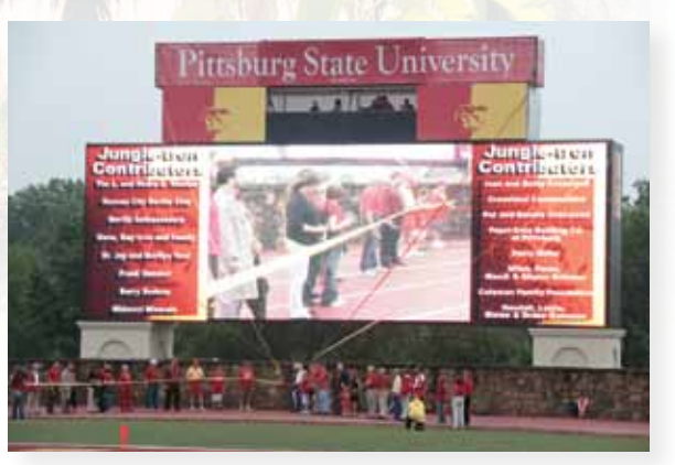
PSU celebrated the ribbon cutting for the Jungletron video scoreboard and display in September 2008, giving visitors to Brandenburg Field/Carnie Smith Stadium a new experience.