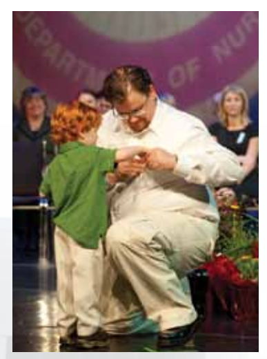
Graduates of the PSU Department of Nursing received their pins in a special ceremony held at Memorial Auditorium in May 2009.