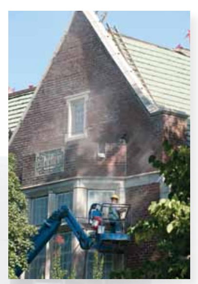
Deferred maintenance funds brought to life several construction and renovation projects across campus, including the refurbishing efforts to historic Porter Hall.