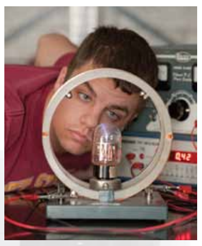
A physics student examines a project in a physics lab located in Yates Hall.