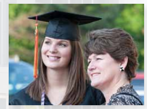
Families of graduates filled the Weede Physical Education Building during commencement exercises. More than 600 students were eligible to participate in the Winter 2008 and 1,100 students in the Spring 2009 ceremonies.