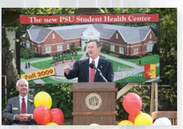
In October 2008, ground was broken for the new Student Health Center. The new facility houses Student Health Services and University Counseling.