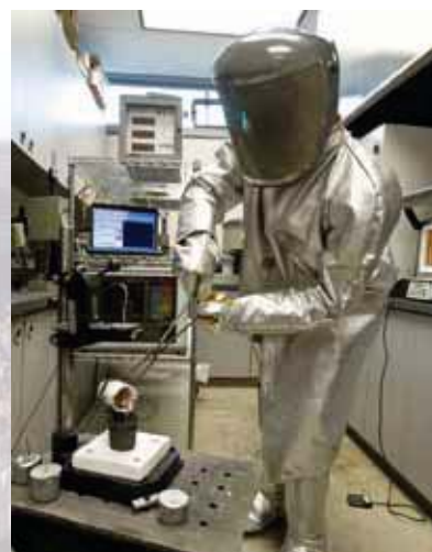
Students in the manufacturing/metal casting program at PSU were the first in the United States to test out a thermal analysis machine.