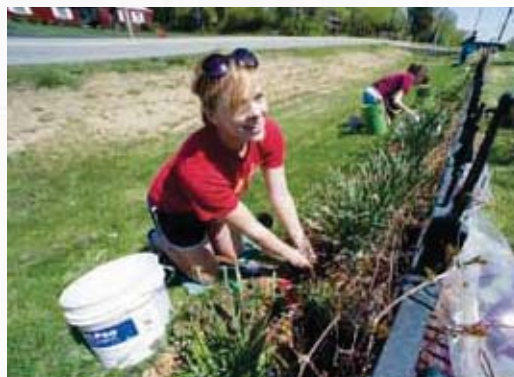
Nearly 600 students participated in the Big Event, an annual community service project held by Student Government Association. Students volunteered at 100 homes throughout the community to assist with yard work, painting, repairs and other odds and ends.